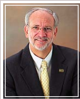
Mayor Gene F. McGee